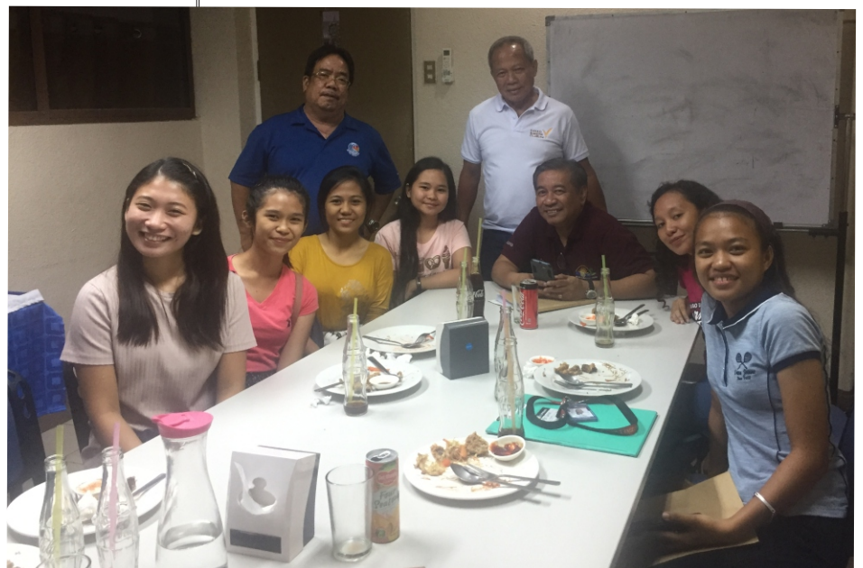
October 5, 2019 Orientation of the incoming Scholars...

Coming up next week are 2 very important activities for our club namely the opening of the Bowling Tournament in which we are hosting and the Fundraiser Dinner Fellowship Show with Actress/Comedian Giselle Sanchez. I am counting on everybody's support of these very important activities and I thank you in advance as I am positive that these activities will be a resounding success.